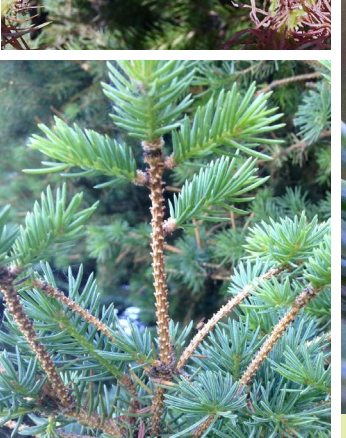
Second-year growth missing due to feeding by older YHSS larvae.

Withered new growth resulting from early instar feeding of YHSS.