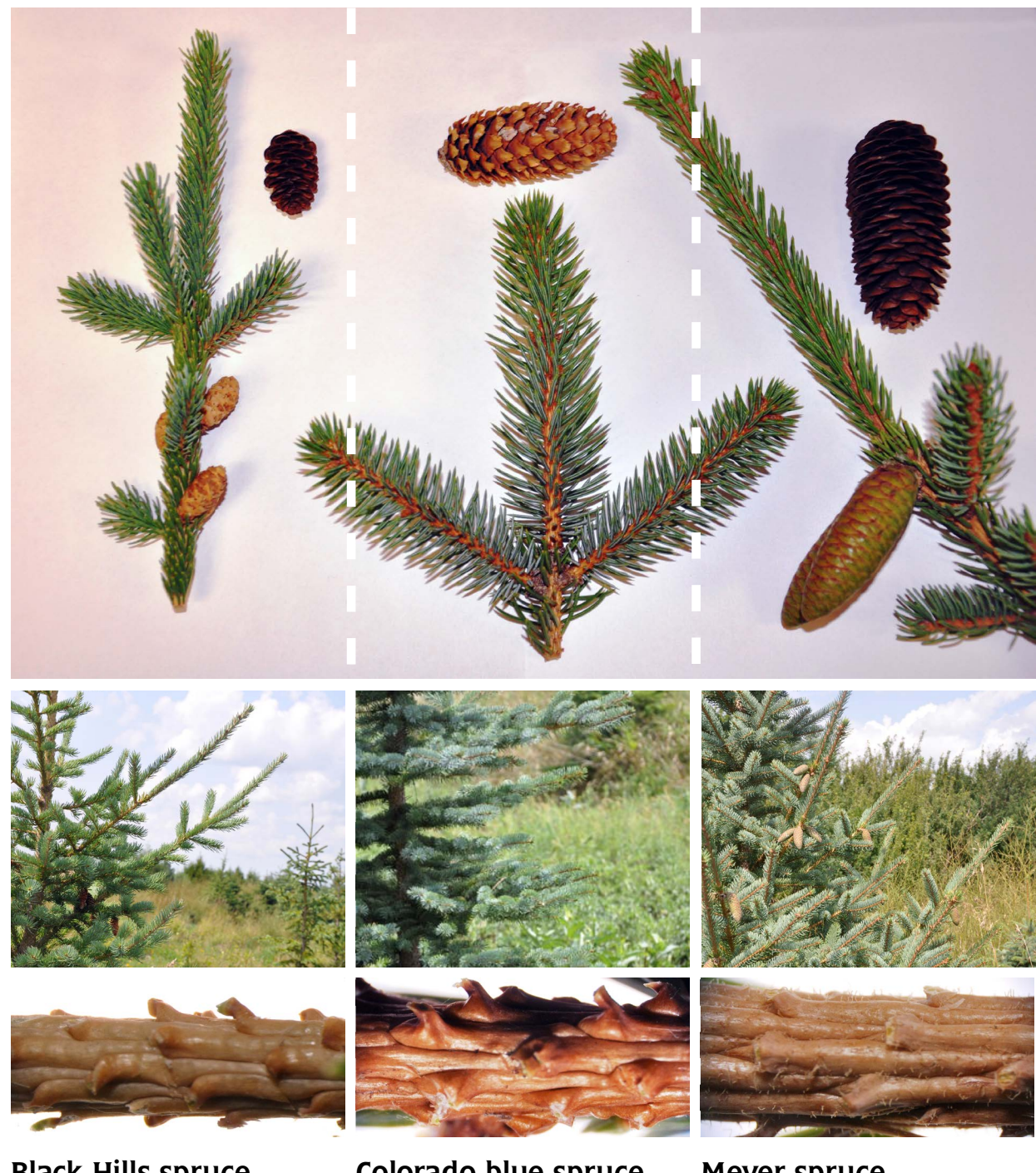
Black Hills spruce (Picea glauca var. densata)

Small (1.5- to 2-inch) brown cones, hairless glaucous (whitish) twigs and upright growth pattern.