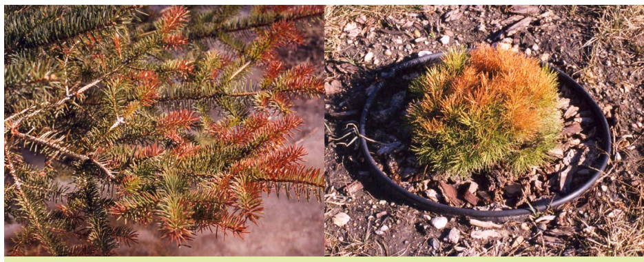
Various springtime symptoms indicating winter injury.