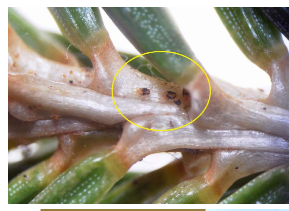
Discoloration and stippling typical of spruce spider mite feeding damage.