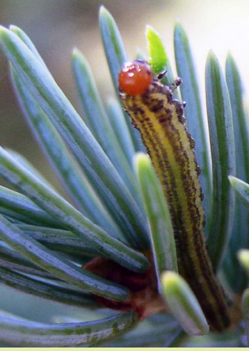
A close-up of a YHSS larva. Note, despite the name, the head capsule is often reddish, rather than yellow. (Joseph Zeleznik, NDSU)