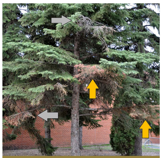
Orange arrows showing more recent infections and gray arrows showing older infections.

(Being renamed as Valsa canker of spruce, caused by the fungus Valsa kunzei (syn. Leucostoma kunzei). The imperfect stage is Cytospora kunzei (syn. Leucocytospora kunzei).