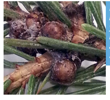
Female scales at the base of the previous year's twigs can be mistaken easily for actual buds. (Stevan

This insect is very inconspicuous and can be overlooked easily. While it is most often found on Norway spruce, it has been observed on Colorado blue spruce, especially in the eastern part of the state. Heavy infestations can result in a secondary problem with sooty mold, which will kill lower branches. Conventional insecticides are effective only in mid to late spring, when crawlers are active. Horticultural oils may be effective in late fall or early spring.