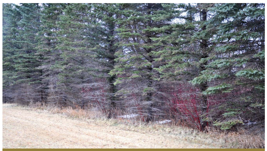
Loss of needles on lower branches a typical symptom of Stigmina and Rhizosphaera needle cast infection. (Aaron Bergdahl, North Dakota Forest Service)