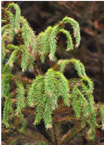
Wilting and abnormal new growth of spruce affected by a high dose of glyphosate. (Aaron Bergdahl, North Dakota Forest Service)

A spiral pattern of damage typical of spruce exposed to broadleaf weed herbicides. (Aaron Bergdahl, North Dakota Forest Service)