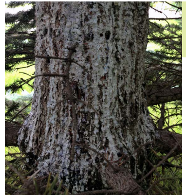
A close-up of the neatly arranged holes characteristic of sapsucker feeding.

Pitching in response to heavy sapsucker damage.